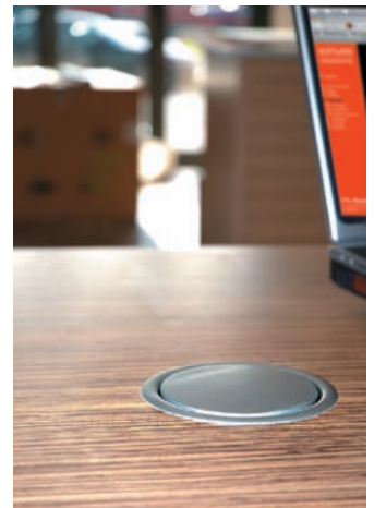
The EVOLine® Port in the kitchen (top) and in the office (bottom), with internet. Pops up easily then fully retracts into benchtop/desk after use.